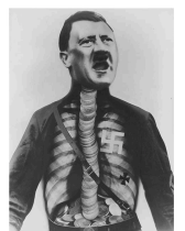
Adolf the Superman Swallows Gold and Spouts Junk - John Heartfield (1932)

When looking at extreme political situations, such as Apartheid South Africa, or Nazi Germany it is clear that creative output was profoundly influenced by the dominant political climate.