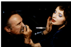
David Lynch - Blue Velvet (1986)

All disciplines have attached to them a theoretical discourse. This could be from establishing writing around the discipline or from new theorists exploring the nature of a particular medium. A major historical example would be Freud's theories relating to the unconscious, which have heavily influenced Fine Art practice from the Surrealists onwards.