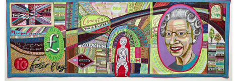
Grayson Perry - Comfort Blanket (2014)

Are there any particular cultural contexts or concerns relevant to the production or interpretation of the work? When engaging with other cultures, ethical considerations are important. When dealing with ones own, a more critical view is common. Here Grayson Perry 'warmly' pokes fun at his own culture.